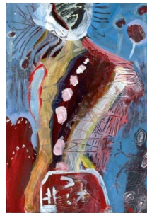
Joe Jacoby, Statue Carving acrylic on postcard, 2006