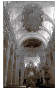
Laurel Casjens, Alta Kapelle , Regensburg, Germany infrared photograph, 2007